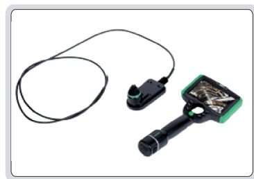
replaceable lens cable